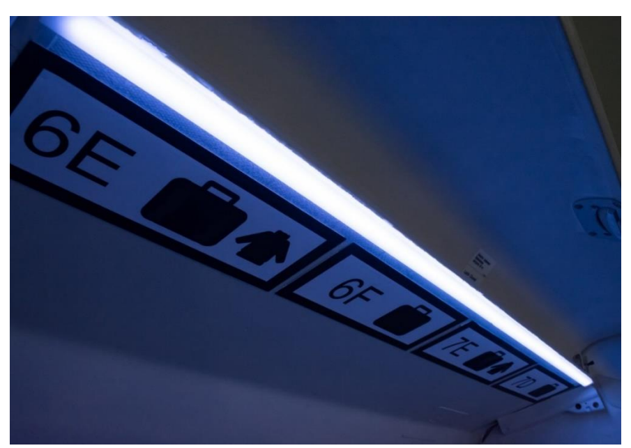
Figure 2. Luggage divisions including a light strip, an outline, seat number, and icon.

Before being able to find the best spot and the optimal loading of the bins, passengers are asked to provide the airline with their hand luggage dimensions while booking their ticket or checking in (on the application, the website, or at the check-in desk). Passengers who provide the airline with this information can/will board first. An algorithm calculates the optimal hand luggage division in the overhead bins to make these fit. Passengers, for whom the luggage will not fit, will be asked to check-in their hand luggage.